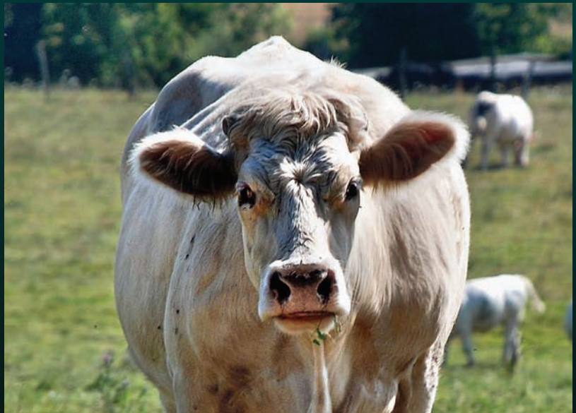
Take a closer look.

Join two award-winning landscape gardeners and share traders for a fascinating look at wealth and happiness. Through a series of stunning photographs, discover what nature can teach us about money, love and life.